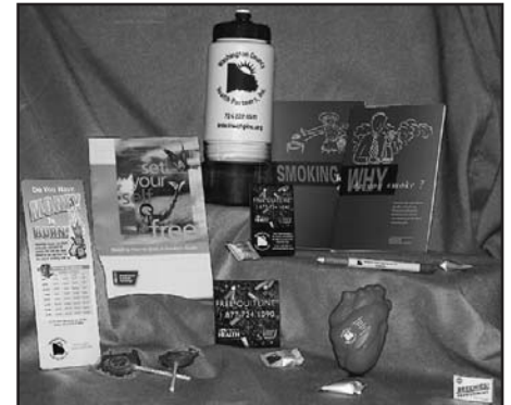
Tobacco Quit Kit

In order to get a Tobacco Quit Kit, individuals must fill out a one-page registration form.